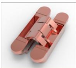
Koper | Cuivre Kupfer | Copper