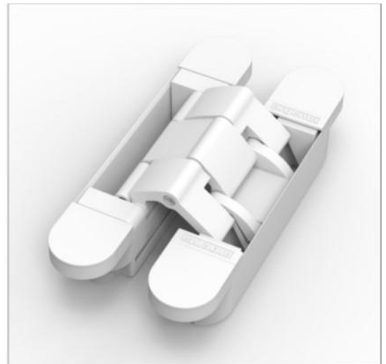
Wit | Blanc Weiß | White