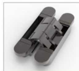
Donker bronz | Bronze foncé Dunkel Bronze | Dark bronze