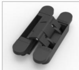
Zwart omber | Ombre noir Schwarz Umber | Black umber