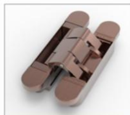
Bronz | Bronze Bronze | Bronze