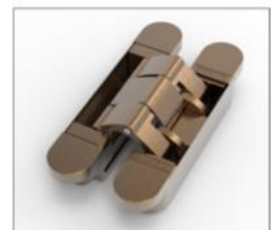
Klassiek bronz | Bronze classique Klassische Bronze | Classic bronze