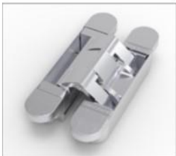
Inox look | Look inox Edeltahl-Look | Stainless steel look