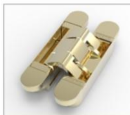
CU (gepolijst messing) | CU (aiton poli) CU (poliertem Messing) | CU (polished brass)