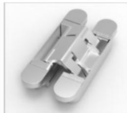
Mat chrom | Chromé mat Chrom matt | Matt chrome