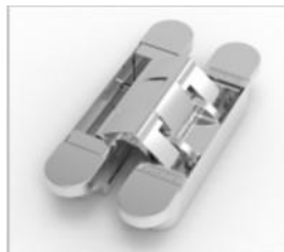
Blinkend chrom | Chromé brillant Chrom glänzend | Glossy chrome